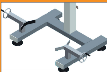
Dual spindle clamping (+031)