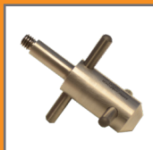
Peg hub as. QM